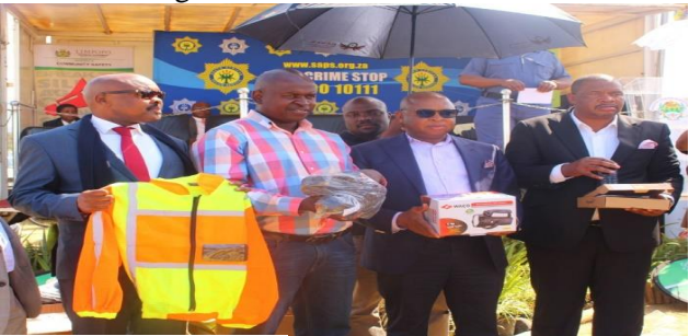
Image 2: The South African Police Service and Community Policing Forums members

According to Govender (2019), the extent in which the CPFs plays in crime prevention in many police stations is not that clear, the Herald (2019), indicate that, large number of men in collaboration with the SAPS from the Ritavi Police Station took a decision to introduce and apply street policing through the CPFs in fighting the gangs that were tormenting and killing innocent members of the community. The group was staring at 20h00 during the week and 21h00 on weekends. During the crime fighting campaign, the established community policing structure managed to arrest six members of the Boko Haram and hand to the SAPS. In support of the established CPFs, the SAPS equipped the established CPFs with various necessary crime combating equipments such as reflectors jackets and torches, to name the 02.