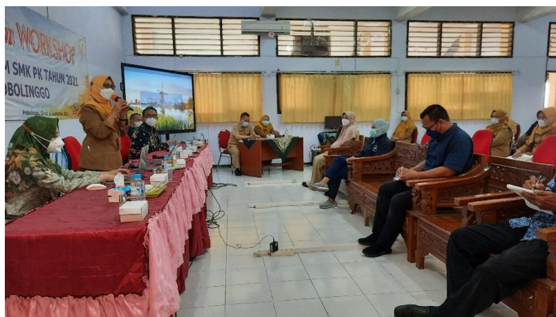
Figure 1. Message from the Principal of VHS 1 Probolinggo

The purpose of this community service is to train and assist teachers of VHS 1 Probolinggo as a school that implements the Vocational High School Center of Excellence program to develop learning, media, and learning models that can accommodate the creativity skills of students in the digital era. The number of participants in the activity reached 30 participants, and the majority were teachers who taught the competency skills of Office Management and Business Services.