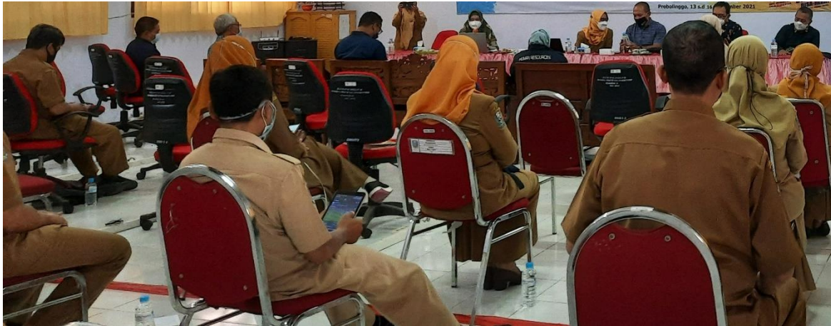
Figure 2. Submission of Materials by the Community Service Team