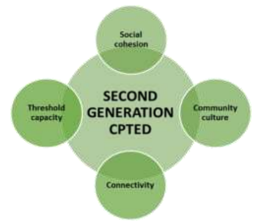
Figure 2. Second generation of CPTED Model

The Second Generation concept is drawn from emerging sociological research on collective delicacy and land use capacity. It also encompasses the principles of political and cultural connectedness that have emerged in subsequent literature (P. Cozens & Love, 2017).