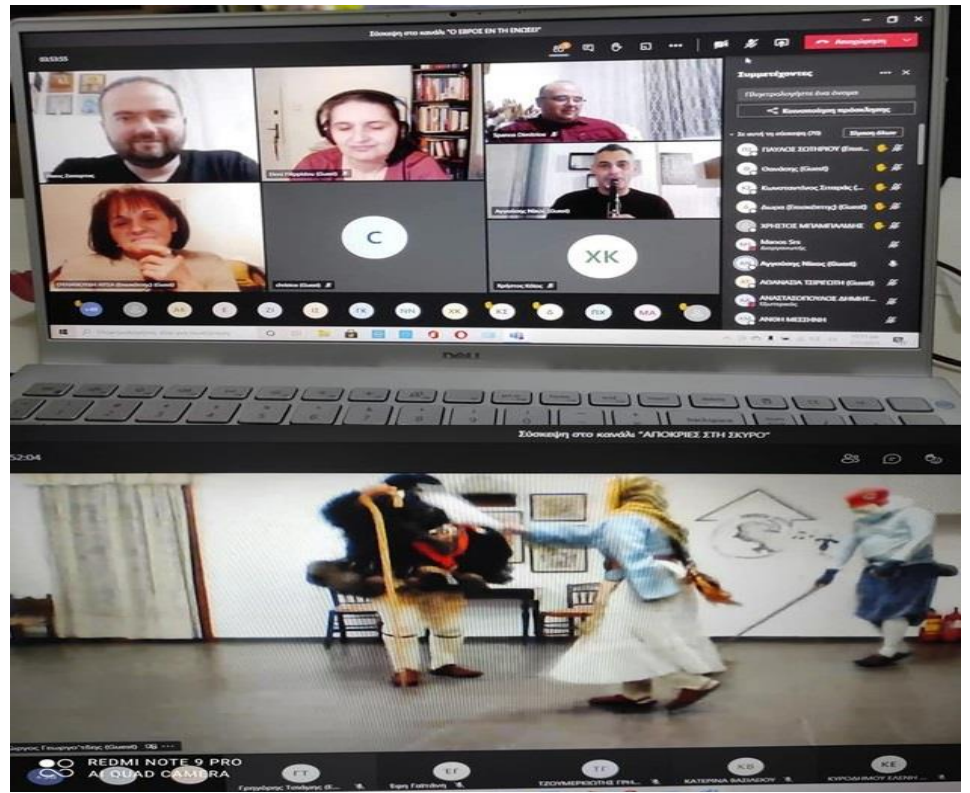
Figure 2. The virtual dance community "Traditional Dance Online Seminars" on the Microsoft platform teams

International Journal of Social Science Research and Review