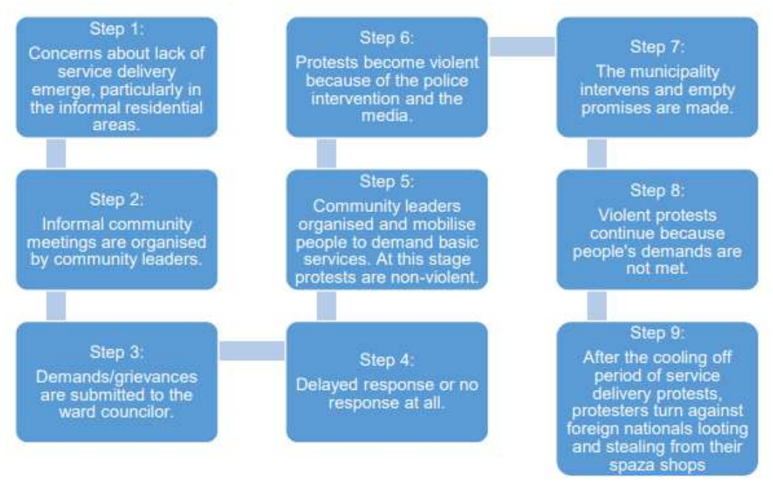
Figure 1: Protest development in Township communities

Hough (2008) argues that poverty in certain areas can lead to the development of RD (xenophobic attacks). Magwaza (2018) suggests that violent protests often reveal the violence that is associated with foreign nationals from a socio-economic and psychological standpoint. According to Duffy (2000, cited in Mathonsi, 2017), some districts in England are deprived, marginalized, and socially excluded. Residents in these areas often feel that public services do not meet their needs, which can lead to frustration. This frustration can occur when these areas receive poor services, such as inadequate healthcare, education, and police services. Duffy (2000) adds that municipalities should prioritize the delivery of services to these communities, as residents in these areas cannot afford private services. Duffy also highlights that the needs of people in these deprived areas are often not met with high-quality