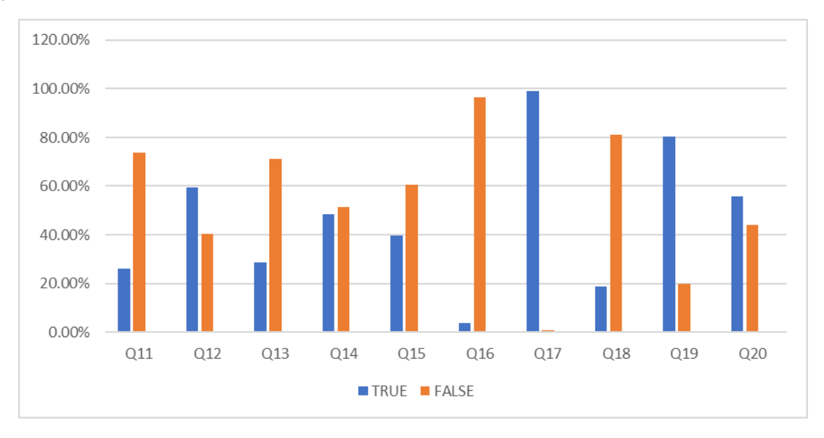
Figure 3. Results of the General Skills Test Bhabinkamtibmas

On the other hand, the table below presents the results of the Bhabinkamtibmas general skills test, namely: