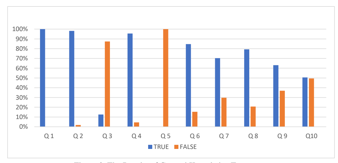
Figure 2. The Results of General Knowledge Test

Further analysis of the data will be presented in the following sections to provide a more detailed profile of the Bhabinkamtibmas' general competencies in terms of both knowledge and skills.