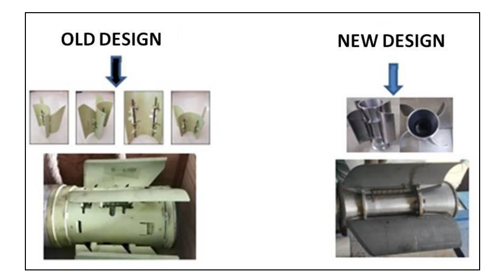
Figure 2. Image Nozzle dan Fin Assy

In the old design image, it is bent by aluminum using a less rigid spring so that when sliding it still experiences vibrations in the fin which is only supported by the strength of the spring on the fin. So that the vibrations cause inconsistencies in the trajectory movement when the rocket is gliding which causes a shift. the location of the desired target. Meanwhile, in the new design on the R-Han 122 B fin, which is designed from metal as a whole, with a more rigid spring when it opens, it immediately locks the fin position by 2 pens on the rocket. The system used is from Avibras by adopting a locking system on the part of the rocket. This is one proof that Transfer of Technology is very much needed in the context of mastering technology in the National Defense Industry.