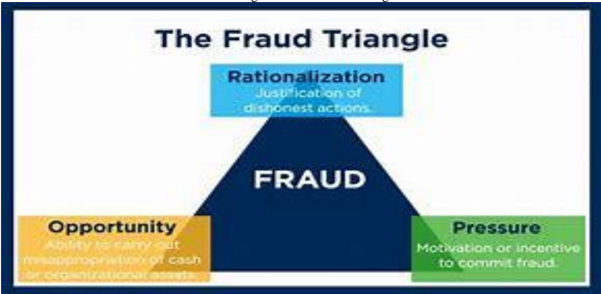
Figure 1: The Fraud Triangle